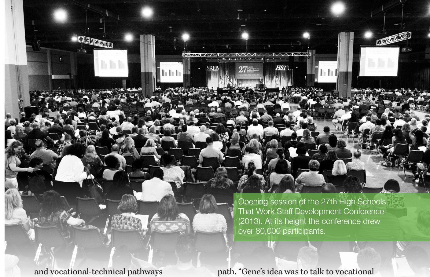
Opening session of the 27th High Schools That Work Staff Development Conference (2013). At its height the conference drew over 80,000 participants.